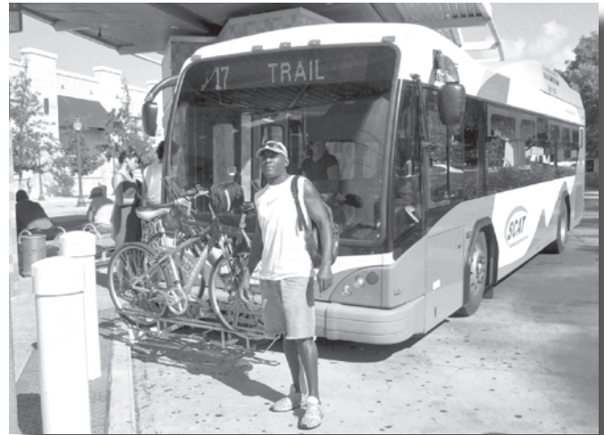
Fellow rider with his bike and mine on the bus

SCAT operates 24 different local bus routes, covering to the south—Venice, North Port and Englewood and to the north—Sarasota and Sarasota/Bradenton Airport. I picked up Route #17 at Old Venice Rd. and 41. This bus travels between Venice Train Depot and 1st & Lemon Street in downtown Sarasota. With buses every 30 minutes, this is a very convenient and reasonable transportation service, operating throughout Sarasota County from 5 am until midnight, 7 days a week. For this run, the cost is 60 cents (seniors) and regular single ride $1.25. Schedules and routes can be found on this Sarasota County Web site: http://www.scgov.net/scat/