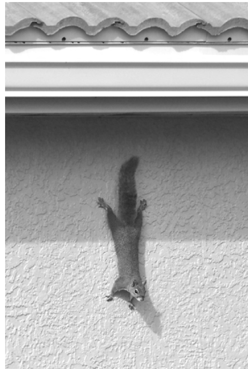
I'm not really crazy – just a little nutty!

Whether gathering food, looking for where they put food, building dreys, watching for predators, or just running around having a good time, the Eastern Grey Squirrel is always on the move.