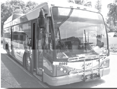
Sarasota Transit Hybrid Bus