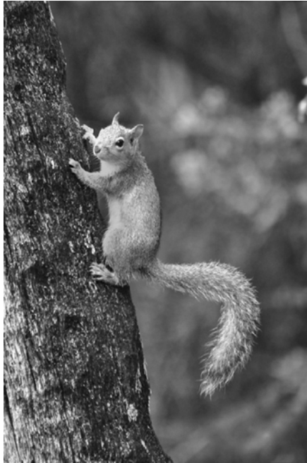
Romeo never had what I have – a bushy tail.

Eastern Grey Squirrels are common in the eastern half of the U.S., the Midwest, and some parts of Canada. Body length of males and females is about ten inches.