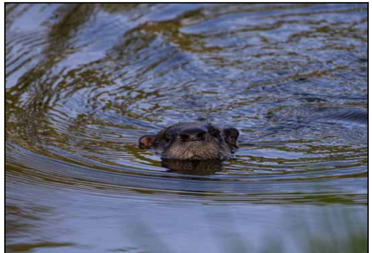
River Otters are equally at home in the water and on land. Is there anything cuter than this little face enjoying a swim?