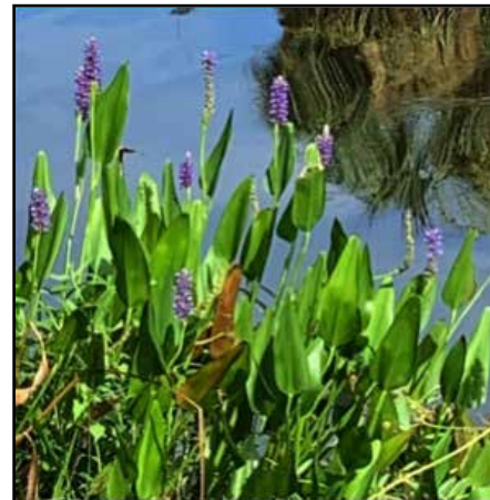
Pickerelweed - one of three native Aquatic Vegetation planted for their deep roots to filter excess runoff & nutrients, plus control erosion

Editor's note: The P&P Committee thanks Mollie for sharing her expertise and supporting our efforts. We are honored by this recognition.