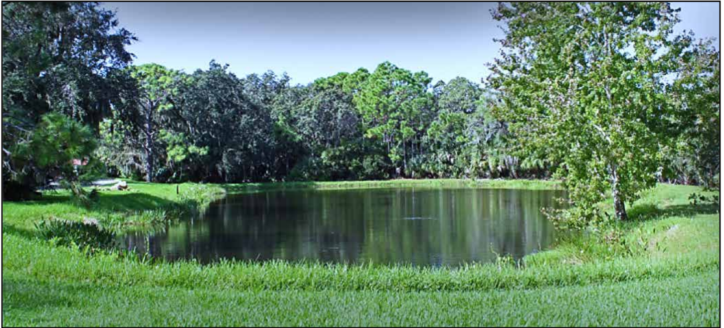
"Rivendell Natural Shoreline" at Egret Pond. Our community standard is a 3-foot LMZ, trimmed to 8-12 inches, with aquatic plants.

(Rivendell Recognized as Leader continued)