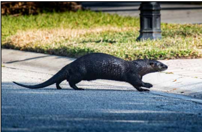
Why did the River Otter cross the street? Because he's curious by nature and seeks out exciting new adventures around Rivendell.

Protect their Habitats. We can help our River Otter friends by recycling, reducing use of toxic pesticides and fertilizers, properly disposing of fishing line and remembering to keep our wildlife wild by never feeding, harming or approaching them. Let's keep our ponds and preserves healthy and attractive for these wonderful River Otters and other wildlife friends. We will enjoy their beauty, plus keep our property values strong. We remind you to view the amazing P&P Wildlife Photo Gallery at www.rivendellcommunity.com/ponds.