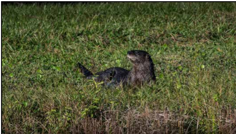
An avid hunter, this River Otter is looking for his next meal