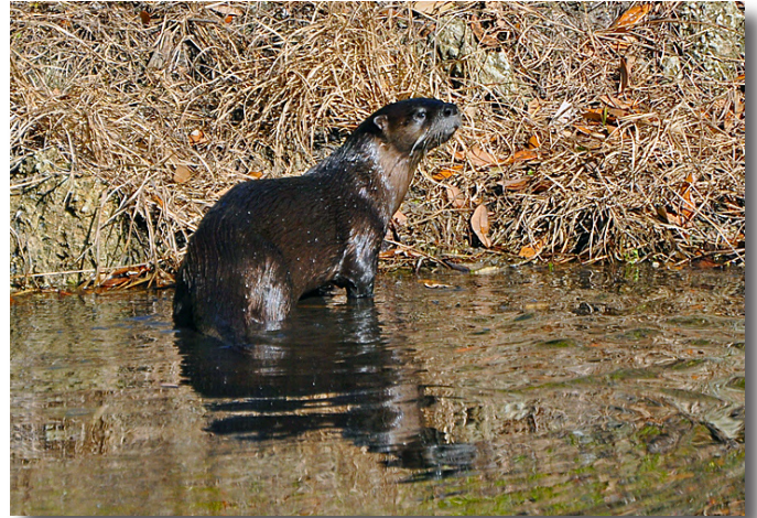
Proud Mama Otter

There will be many opportunities to photograph a mottled duck flying by, or a confrontation between herons and egrets, but it will probably be a long time before I see another river otter and her pups!