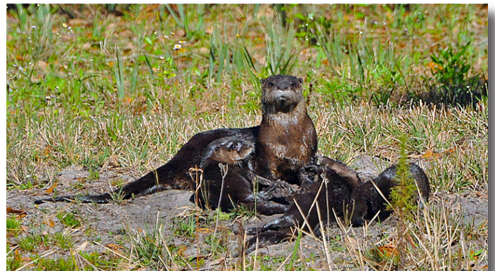
We otter be in pictures~ photo by Kay Mruz