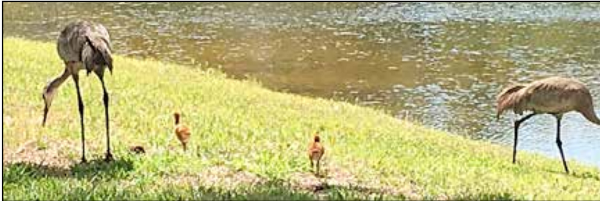
Lunch Time ~ photo by Jane Tavares, 3/27/2017

Caution! Please drive slowly as the crane parents and their adorable offspring are exploring the neighborhood.